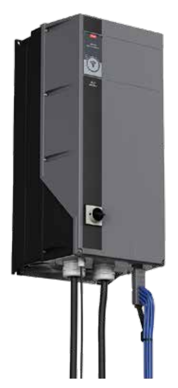
The PTU 025 is easily mounted into the FC 102 drive enclosure, and provides 360° access for optimal tube connections.

It is easily mounted into the enclosure of the VLT® HVAC Drive, and retrofitted existing drives.